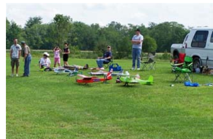
Some WASPS members at the "Oz Freefall Event".