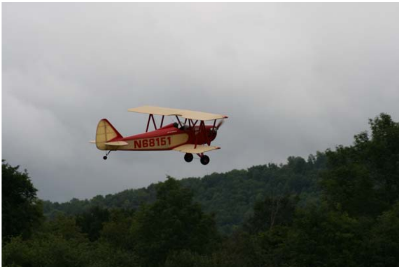
Gary Fitch (STARS) "Balsa USA Fly Baby Bipe" at the STARS Open House.