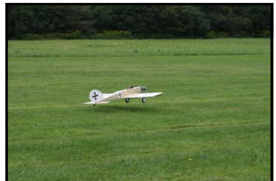
Ben Kirk's "Big Stick" taking off at the STARS Open House.