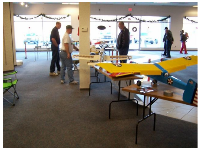
Pictures from Holiday Family Model Airplane Display.